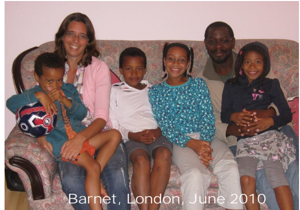
Barnet, London, June 2010