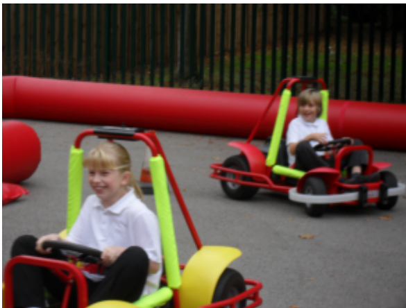
Youngsters enjoying Go Kart rides at a recent 'Fusion' event for local children.

Cheshire East are consulting residents on future plans for Alsager. If you are interested in the development of our town, then please complete the Place Shaping questionnaire at: www.cheshireeast.gov.uk/ldf